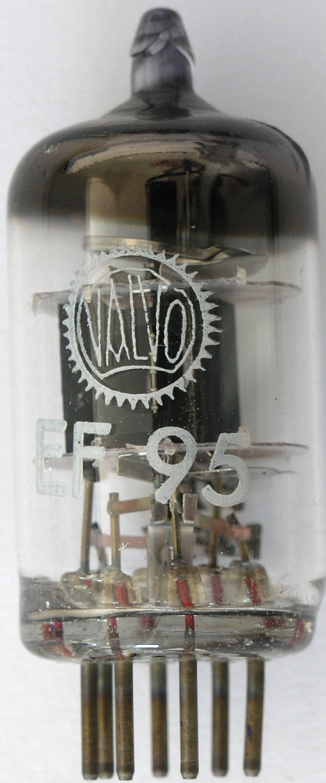
Valvo EF 95